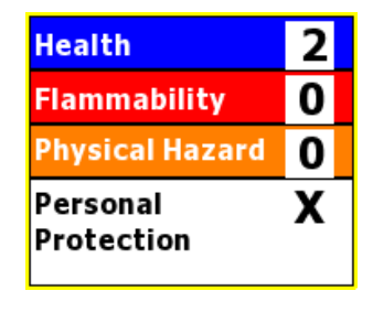
HMIS RATINGS (0-4)